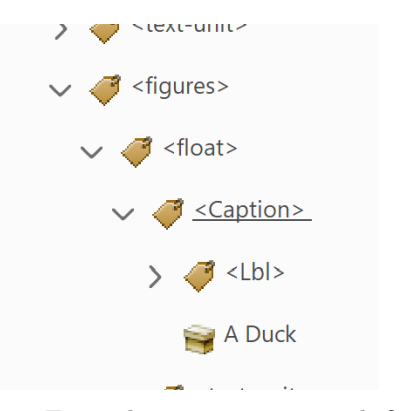
Figure 5: Example structure tree with figure

Initial support for minipage and \parbox has been added. But the content of such boxes can be arbitrarily complex, and it is unclear if the current code works as desired in all cases.